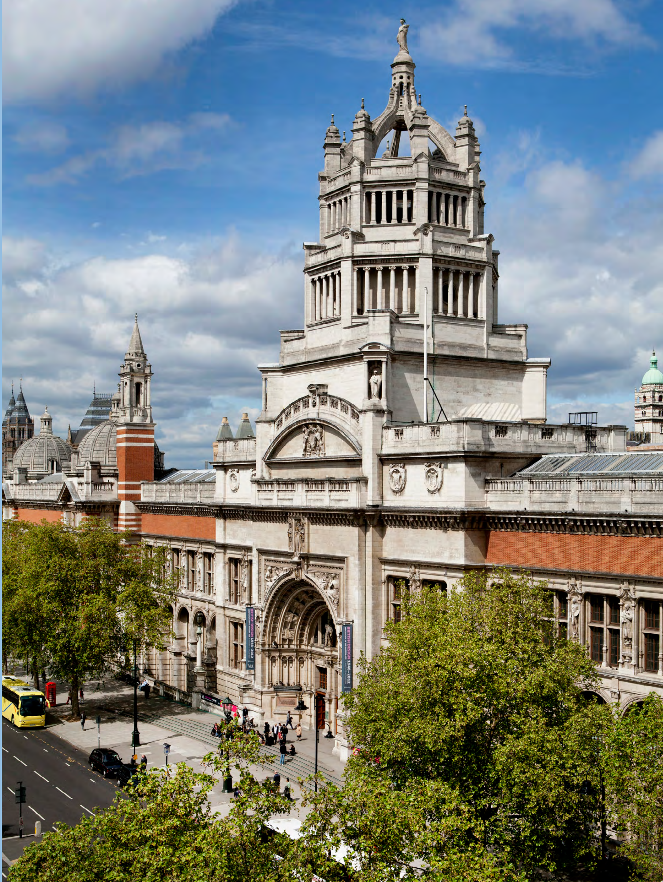
Cromwell Road Entrance